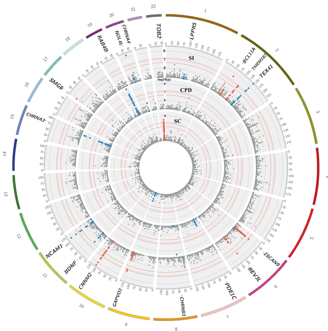
Fig. 2 A concentric Circos plot of the association results for smoking initiation (SI; outer ring), cigarettes per day (CPD) and smoking cessation (SC; inner ring) for chromosomes 1–22 (Pack-years results, which can be found in Supp. Figure 1, are omitted for clarity). Each dot represents a SNV, with the X and Y axes corresponding to genomic location in Mb and -\log_{10}P -values, respectively. Labels show the nearest gene to the novel sentinel variants identified in the discovery

stage and taken forward to replication. The top signals were truncated at 10^{-10} for clarity. Novel and previously reported signals are highlighted in red and dark blue, respectively. Grey rings on the y-axis increase by increments of 2 (initial ring corresponding to P = 0.001 , then 0.00001 etc.); and the outer and inner red rings correspond to the genome-wide significance level ( P = 5 \times 10^{-8} ) and P = 5 \times 10^{-7} , respectively. Image was created using Circos (v0.65)