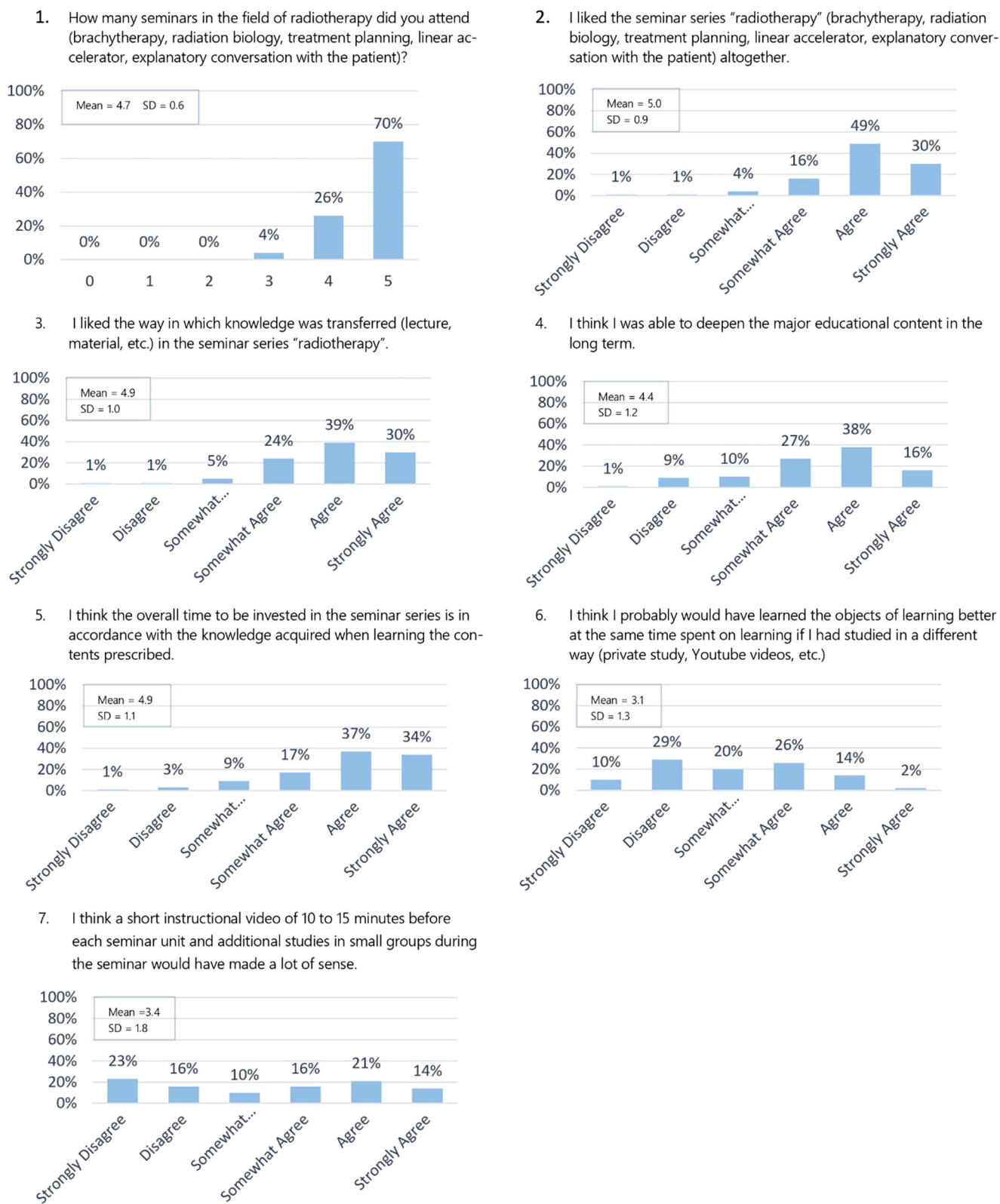
Fig. 1 Participation, acceptance, assessment of the effectiveness in terms of learning, and on a potential use of e-learning methods among medical students in connection with radiation oncology seminars