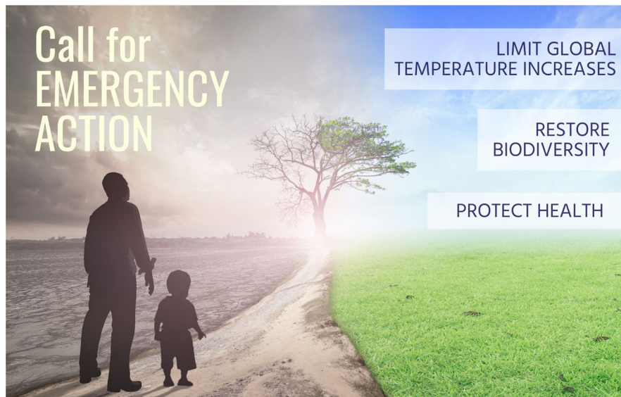
FIGURE 2 Call for emergency action to limit global temperature increase, restore biodiversity, and protect health

events. The Paris Climate Accord represents the world's desire to combat climate change through reduction of greenhouse gas emissions. In 2015, this historic climate agreement was signed by 196 nations. The main aim of this international cooperation is to enforce the global response to climate change by limiting global temperature rise to 2°C above preindustrial levels by the end of the century and to pursue efforts to hinder temperature increase to below 1.5°C. 16 However, substantial health burdens and health risks due to climate